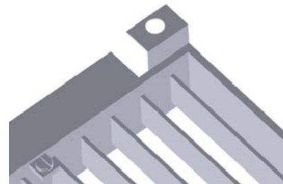
Support Tabs allow for suspension from pedestal head for panel independent mounting, optional screw down mounting