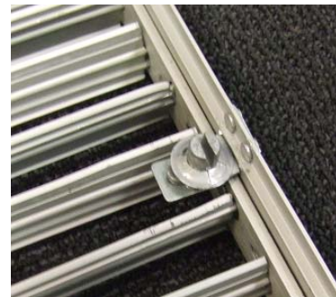
Quarter Turn Adjustment for precise setting of airflow