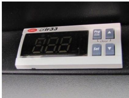
User set point control, display for Rack Face Temperature