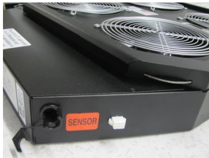
Temperature Sensor Control Cable Probe Connection