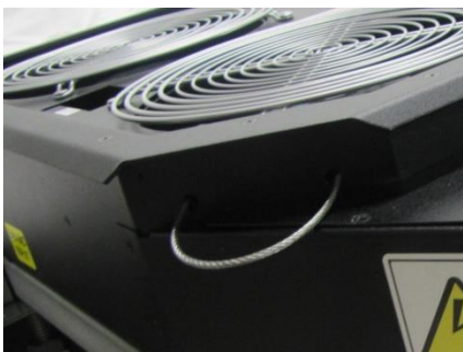
Alternative Corner Lock Hangers