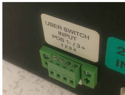
Phoenix type screw terminal connector