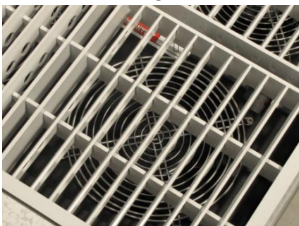
4 x Redundant Energy Efficient EC Fans with 0-100%