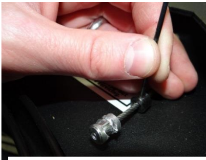
Alternative Corner Lock Hangers