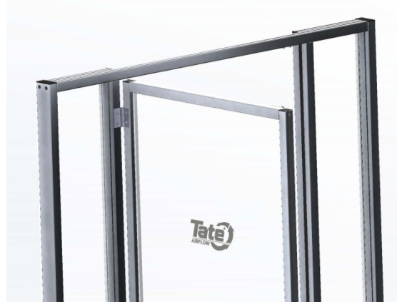
Lift Off Hinge allows for easy installation and maintenance