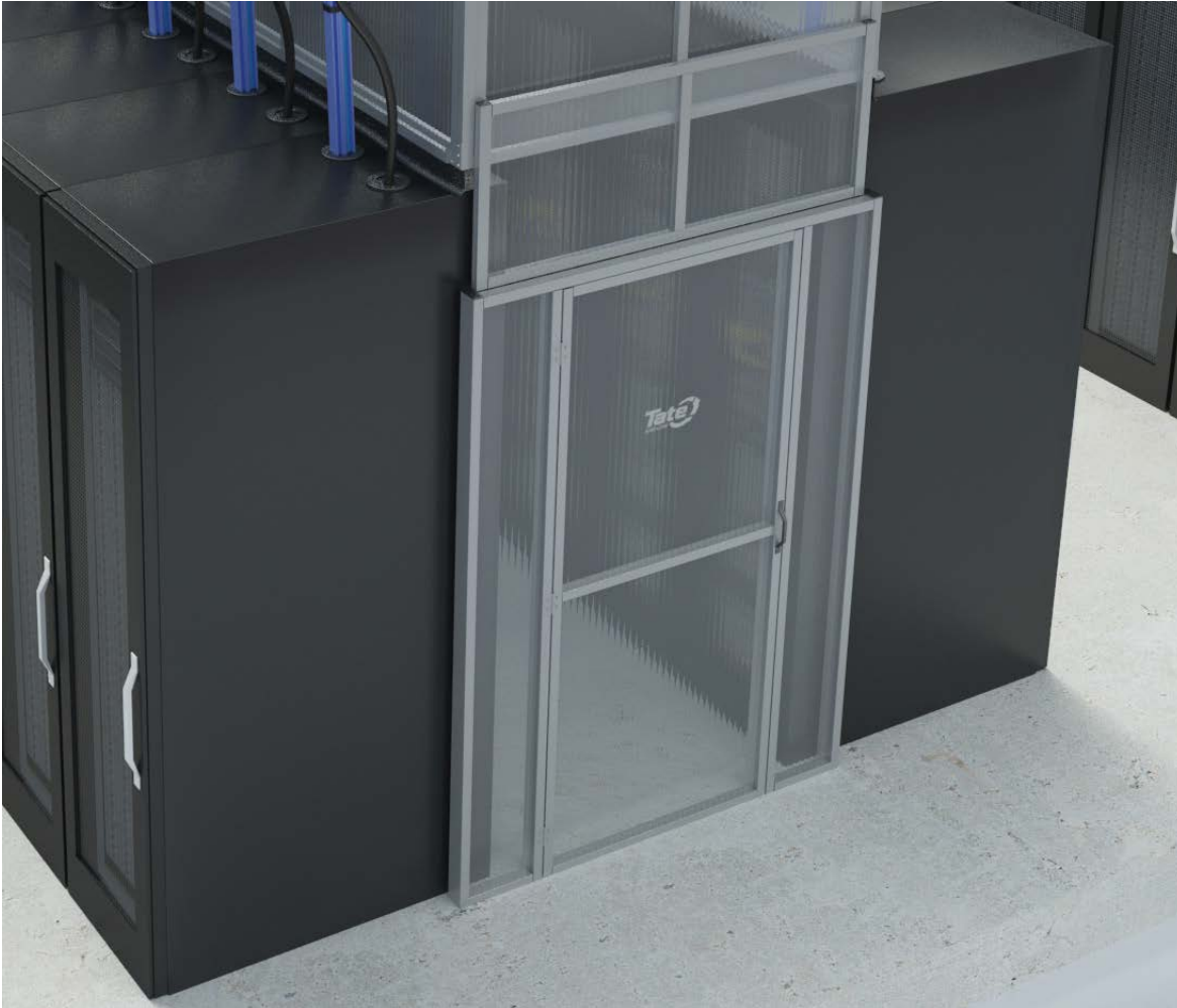
Hinged Door used at end of hot aisle in conjunction with a ContainAire HAC system