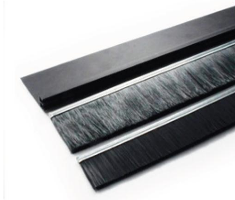
Extended 3" x 60" Brush Grommet Part No. 10097