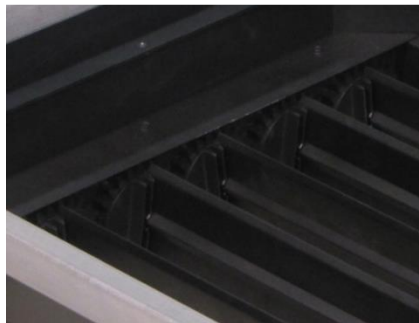
Single Zone Spring Return Damper