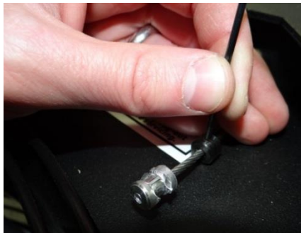
Adjustable Alternative Method For Corner Lock Hanging (1.5mm Hex)