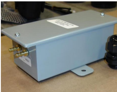
Differential Pressure Meter