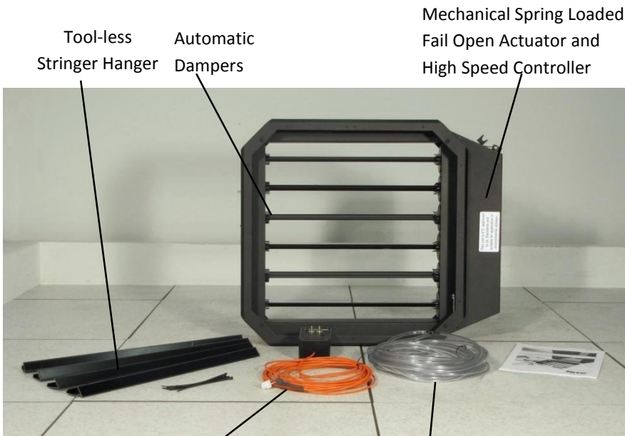
Differential Pressure Meter With 25' Control Cable (orange)