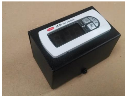
User Set point control on remote Movable Display Unit